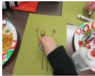
A unique creation in process....