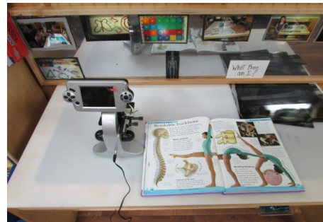
A new microscope helps the Fireflies see what blood cells look like up close!